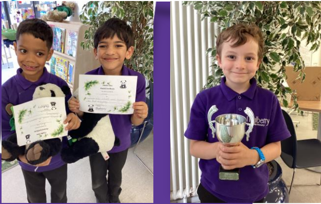
TABLE OF THE WEEK

Every week we reward children for positive behaviors around lunchtime, such as good manners, playing with the resources safely and with kindness, and trying new food. Well done to: